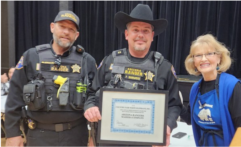
Arizona Rangers Madera Company won “Best Application of the Year.”