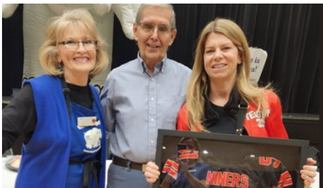
Sahuarita GV 49ers donated a jersey!