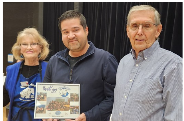
Boys and Girls Club of Santa Cruz County shared their appreciation.