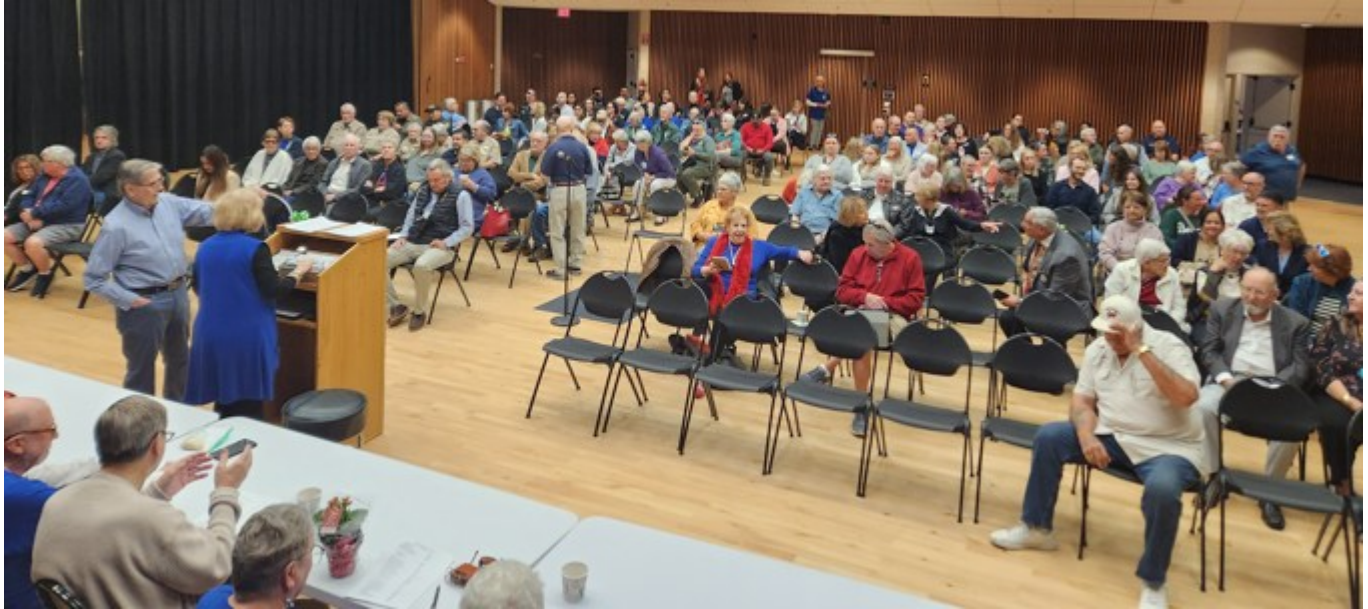
Grant checks were distributed to over 140 Southern Arizona schools and non-profits.