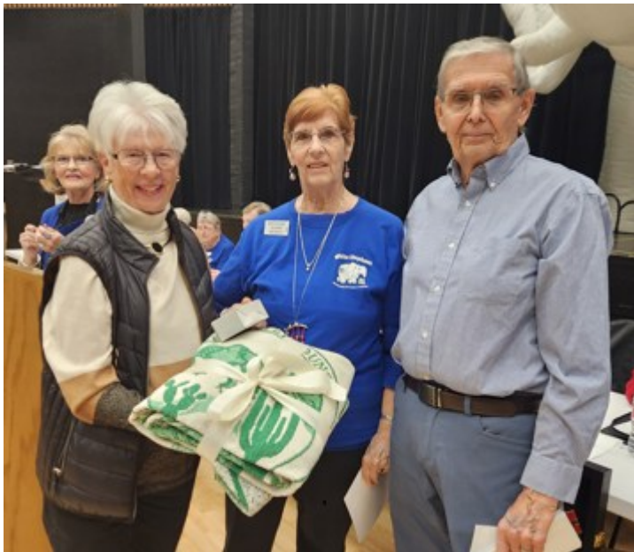
Beautiful blanket with GV logos presented.