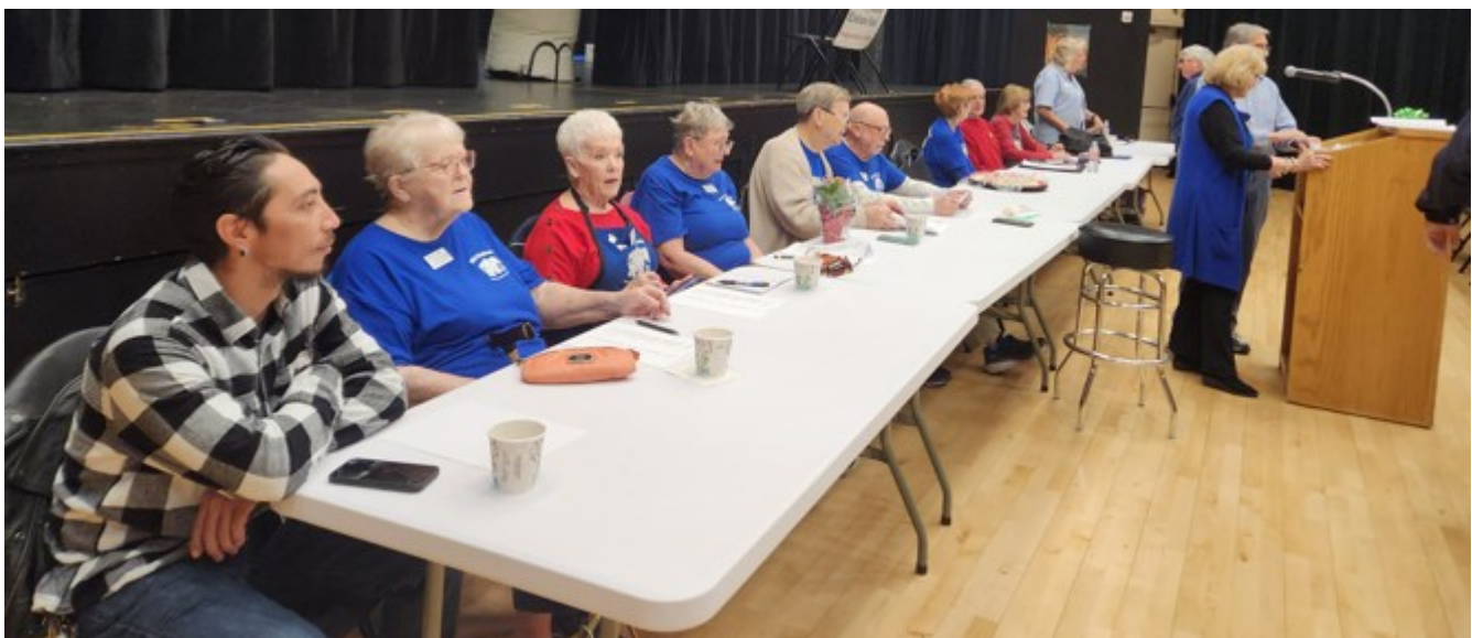
CFWE was well represented at the ceremony by Board, Committee Members and Staff .