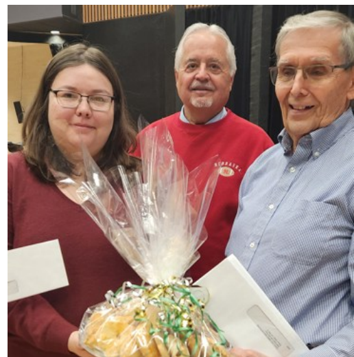
Sun Sounds of AZ brought "goodies!"