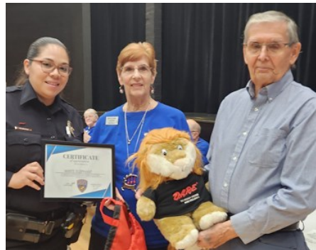
Nogales DARE Program presented CFWE with a plaque and a “cuddly” to say “thanks!”