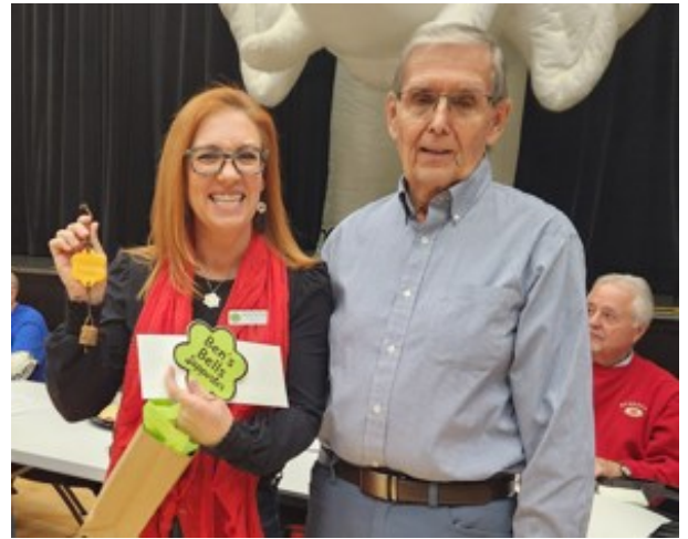
“Ben’s Bell” gave us a “bell” to thank us for their grant.